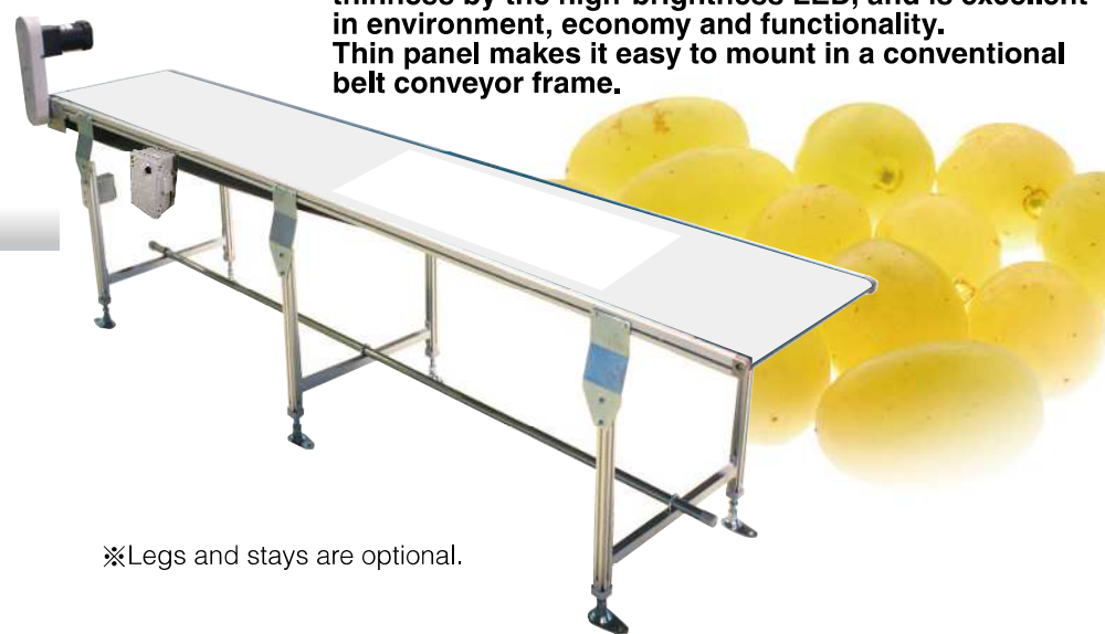
※Legs and stays are optional.

The LED light panel achieves unprecedented thinness by the high-brightness LED, and is excellent in environment, economy and functionality. Thin panel makes it easy to mount in a conventional belt conveyor frame.